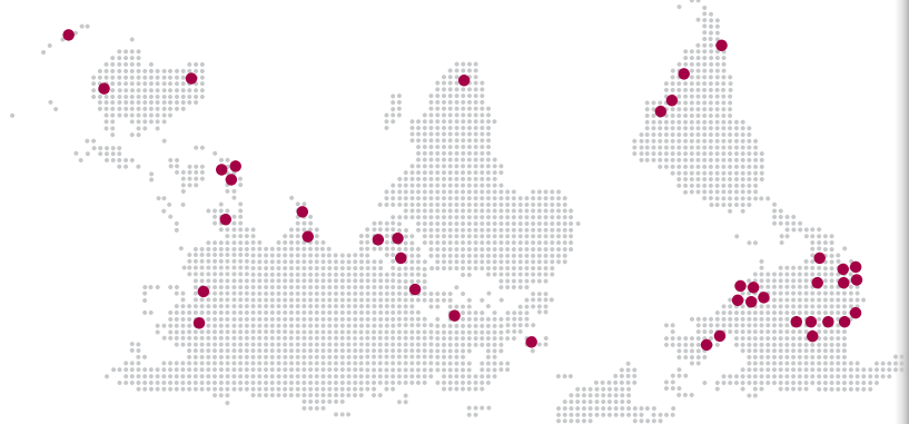
Offices in Over 25 Countries and Growing

Our Positioning is to provide superior results and greater long-term value through The Systems Thinking Approach® to Strategic Management ...Our Only Business